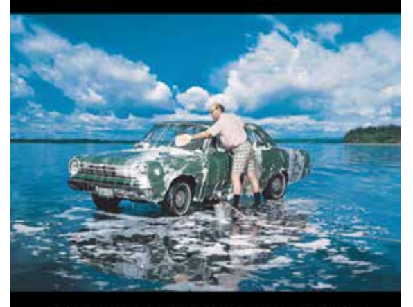
Rain washes pollutants into storm drains which flows directly into our streams, lakes, rivers and the ocean.

IF YOU WASH YOUR CAR IN THE DRIVEWAY, YOU MIGHT AS WELL WASH IT IN THE LAKE.