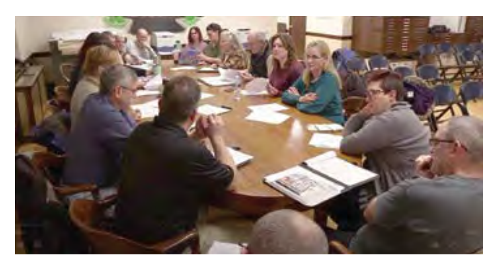
Lehighton Proud Brainstorming Session of the Main Street Steering Committee for our recent HGTV Hometown Takeover Submission. To view the video, please visit: https://www.youtube.com/watch?v=P-0wirSvRak